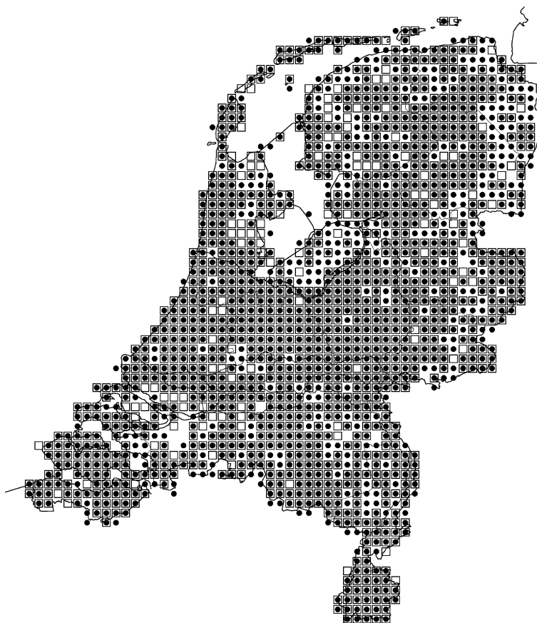
Figure 1. Distribution of records of Syrphidae in the Netherlands before 1988 (squares) and in 1988–2002 (dots). The grid consists of 5 \times 5 km squares.