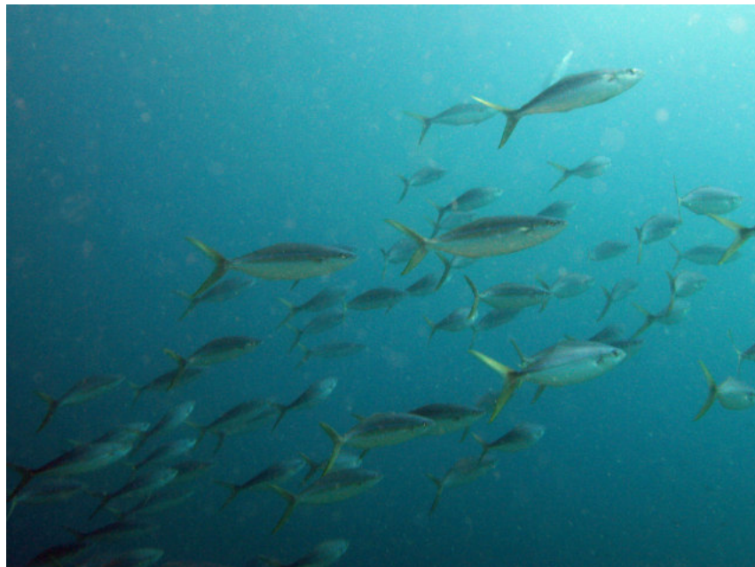
Figure 1 A school of rainbow runners ( Elagatis bipinnulatus , Carangidae) along the drop-off in the Dive Hub MPA.