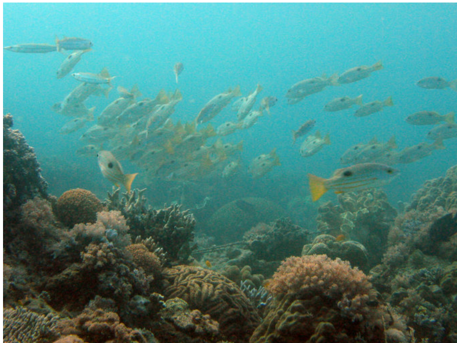
Figure 3 Schools of blackspot snappers ( Lutjanus ehrenbergii , Lutjanidae) with yellowtail barracudas ( Sphyraena flavicauda , Sphyraenidae) in the upper left corner.

Compared to other marine reserves in the Philippines, fish biomass in the Dive Hub MPA has developed similarly as the fish biomass in the Sumilon Island reserve. After three years of full protection, mean fish biomass in the Sumilon reserve increased to 100 tonne/km 2 , whereas in the Apo Island reserve this was about 50 tonne/km 2 (Alcala & Russ 2006). The mean fish biomass of 108.4 tonne/km 2 after three years of protection, as presently observed in the Dive Hub MPA, underlines that the area is fully protected. Moreover, considering that fish biomass values have rapidly increased, it seems possible that biomass may further increase in the future.