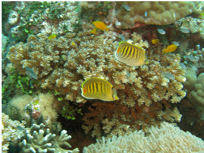
Figure 4 Butterfly fishes (Chaetodontidae), often encountered in the Dive Hub MPA, are indicators of healthy reefs.