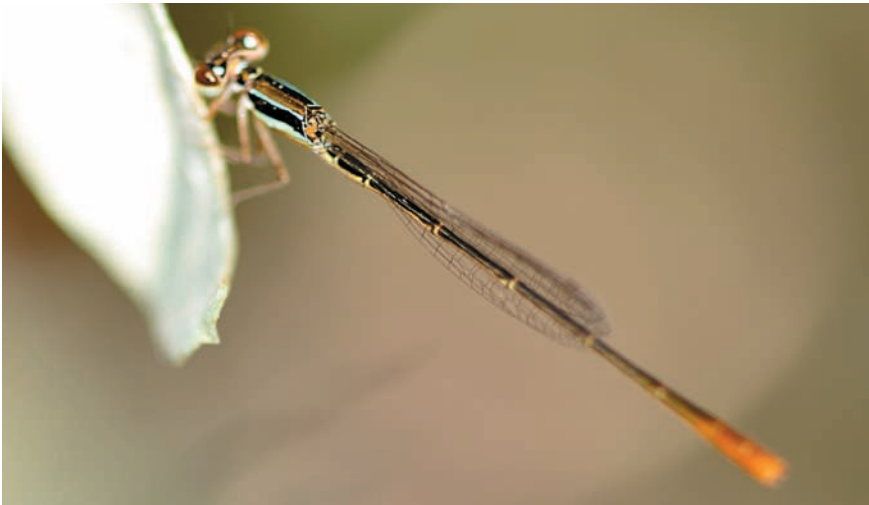
Figure 2: Agriocnemis sania, male, Lake Idku (Buhairat Idkū), Egypt (10-v-2009). – Abbildung 2: Agriocnemis sania, Männchen, Idku-See (Buhairat Idkū), Ägypten (10.05.2009).