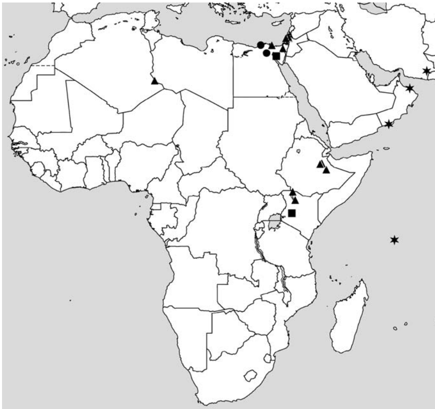
Figure 4: Distribution of Agriocnemis sania . – Abbildung 4: Verbreitung von Agriocnemis sania . ▲ data < 1980, partly extinct (Libya and Near East), Nachweise vor 1980, Vorkommen z.T. erloschen (Libyen und Naher Osten); ■ records from 1990 (Sinai) and 2005 (Kenya), Nachweise von 1990 (Sinai) und 2005 (Kenia); ● new data 2009, neue Nachweise 2009; ★ nearest records assigned to Agriocnemis pygmaea , nächste Nachweise, die Agriocnemis pygmaea zugerechnet werden.

Like I. evansi , I. fountaineae is salt-tolerant, but in Siwa it is much less common and is dominant only at the most saline waters. Females are always heterochromatic – orange, brown or dirty green, depending on age, and black – and lack a black humeral stripe. Like the previous species, I. fountaineae was recorded for