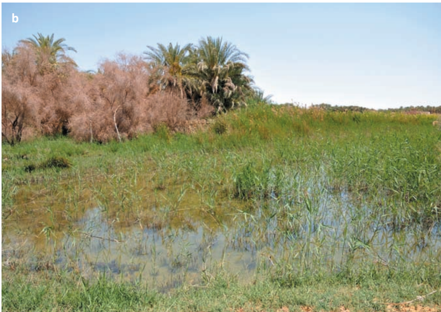
Figure 6a and 6b: Habitat of Orthetrum machadoi in the Siwa Oasis, Egypt (12-13-v-2009). – Abbildung 6a und 6b: Habitat von Orthetrum machadoi in der Oase Siwa, Ägypten (12./13.05.2009).