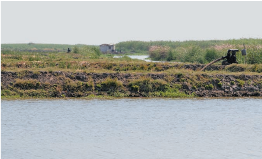
Figure 3: Fish farms south of Lake Idku (Buhairat Idkū), Egypt, showing the destruction of potentially favourable areas for Agriocnemis sania (10-v-2009). – Abbildung 3: Fischzuchten südlich des Idku-Sees (Buhairat Idkū), Ägypten, ein Beispiel für die Zerstörung potentieller Habitats von Agriocnemis sania (10.05.2009).