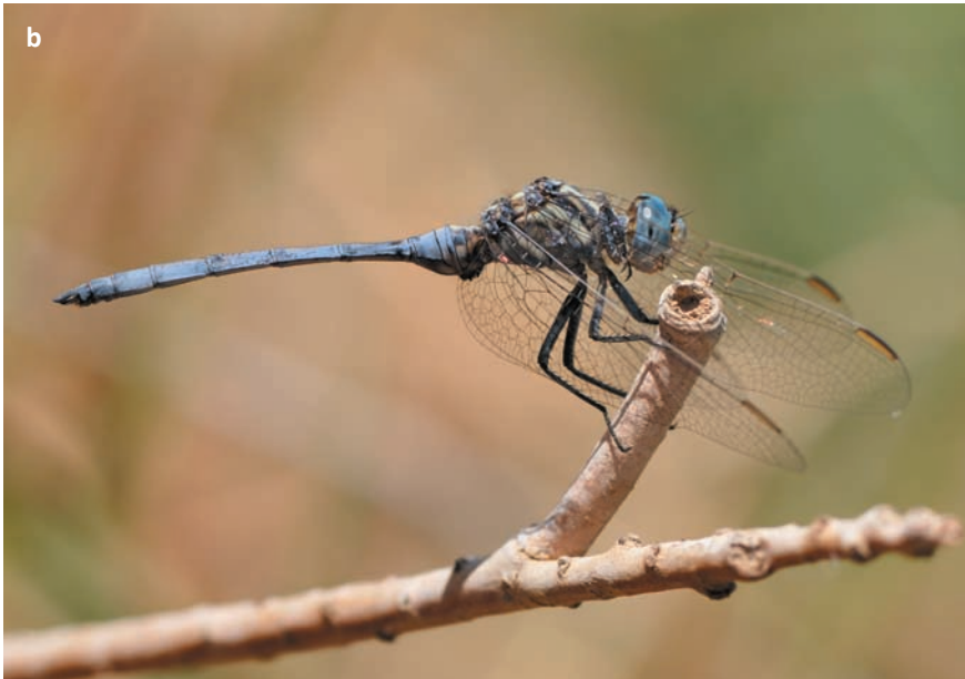
Figure 5a and 5b: Orthetrum machadoi, male, Siwa Oasis, Egypt (12-v-2009). – Abbildung 5a und 5b: Orthetrum machadoi, Männchen, Oase Siwa, Ägypten (12.05.2009).